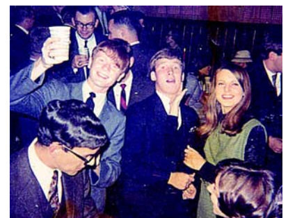
Party Room 1960