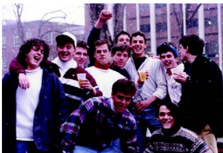
Snow and fun in 1990

It's time that we all get together. There are several alumni between L.A. and San Diego. If anyone would like to help pull something together, please contact Ty Torres '91 at ty-torres@cox.net .